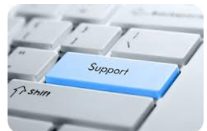
We can program and support your Eclipse system(s) on-line.