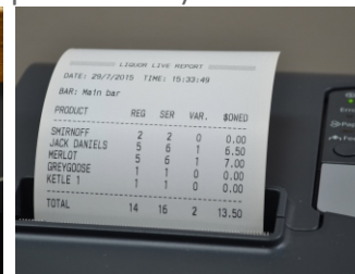
Liquor manager Live ticket report at the bar printer.