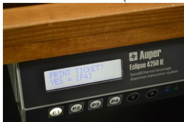
Request a Liquor manager Live ticket report from the Eclipse 4250.

Save 15 to 20% in liquor cost! Increase profits by tracking liquor sales!