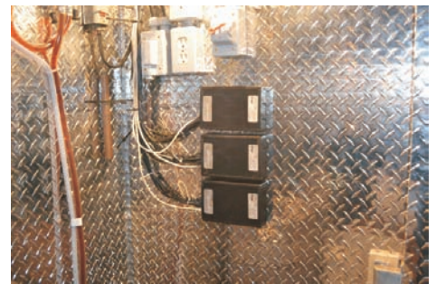
48 flow meter installation with 3 collector boxes mounted in the beer cooler. White network cables going to the manager's office to connect to the Harpagon systems.