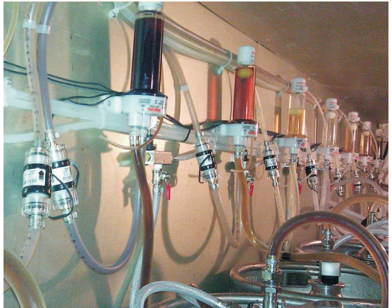
Flow meters and FOBs in beer cooler with cables going to the collector box.